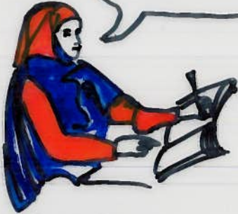
FRANCESCO PETRARCH (1304-1374)

I LOVE CICERO, ST. AUGUSTINE, AND LAURA!